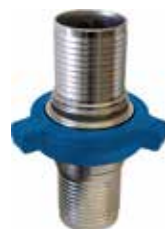
FIGURE 206 FRAC COUPLING