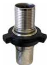
FIGURE 100 FRAC COUPLING

Our hose barb union is constructed of high quality forged steel. The integral hose shank is featured on both the male and female shanks. Both time and money is saved by combining the unions with the integral shanks. No more welding hammer unions to combination nipples. The union end connection is interchangeable with all major hammer union manufacturers products.