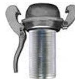
Male Ball x Machine Shank (KC)