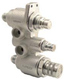
Block Valve - New