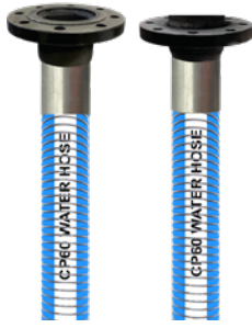
Fixed x Floating