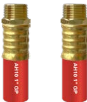
NPT x NPT