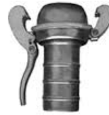
Male Ball x Shank