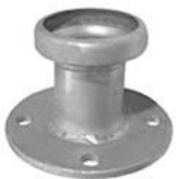
Female Socket x ANSI Flange Reducers