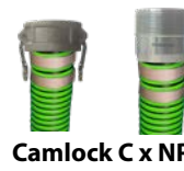
Camlock C x NPT